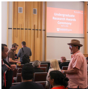
Some photos of our wonderful speakers and the celebration we hosted last week.