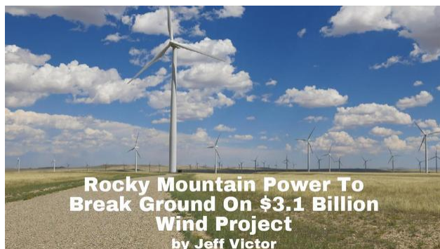
Rocky Mountain Power To Break Ground On $3.1 Billion Wind Project by Jeff Victor

Click the images below to learn more about this month's top stories.