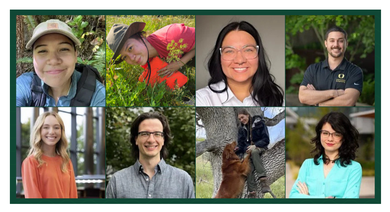
Eight of the 12 new NSF Graduate Research Fellows.

Congratulations to the 12 new National Science Foundation (NSF) Graduate Research Fellows at the UO! When combined with the other NSF Fellows still at the UO, we have a total of 42 graduate students who are currently part of this highly competitive and prestigious program. That is the highest number at the UO in 15 years! Learn more about the prestigious award and the UO research fellows.