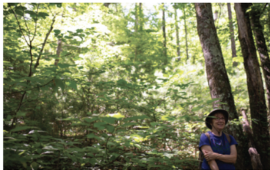
Forest Bathing: How To Cleanse Your Spirit

Click here to find all of our recent blogs or check out the three blogs below.