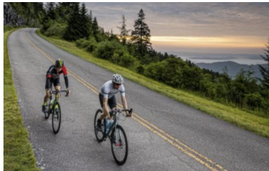
Year of the Trail: Wheely Fun