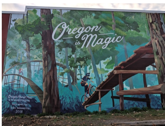
Oakridge mural- photo by Sara Morrissey

If you paint it, they will come. Seven rural communities around the state are now home to hand-painted murals after the launch of the Oregon Mural Trail . Inspired by the Only Slightly Exaggerated campaign's artwork—whimsical scenes of forests, mountains, vineyards, rivers and more—visitors are offered a larger than life glimpse of Oregon's magic. Travel Oregon invites everyone to hit the road and explore the Oregon Mural Trail. While doing so, we encourage you to immerse yourself in the destination and discover the people and places that make these communities so special. As you follow the trail, share the magic using the hashtag #OregonIsMagic .