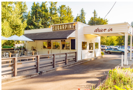
Sugarpine Drive-In

A sweet, new (yet nostalgic) restaurant has opened at mile marker zero of the Historic Columbia River Highway: Sugarpine Drive-In . Set on the banks of the Sandy River just outside of Troutdale, husband and wife chef team, Ryan Domingo (Pok Pok) and Emily Cafazzo (Beast) have opened a destination drive-in restaurant offering a variety of classic American comfort foods with a “Portland foodie” twist—waffle grilled cheese sandwiches, foot-long Olympia Provisions chili dogs, and seasonal adult slushies are just a small sample of the tasty treats in store. After opening in July 2018, this place has already become a local (and Instagram favorite , #youaresogorge) of the Columbia River Gorge region. To celebrate the changing of the seasons, Sugarpine is launching their winter menu on Nov. 29 and will have a waterproof, heated tent to keep everyone cozy during the colder months.