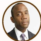
Cornell William Brooks