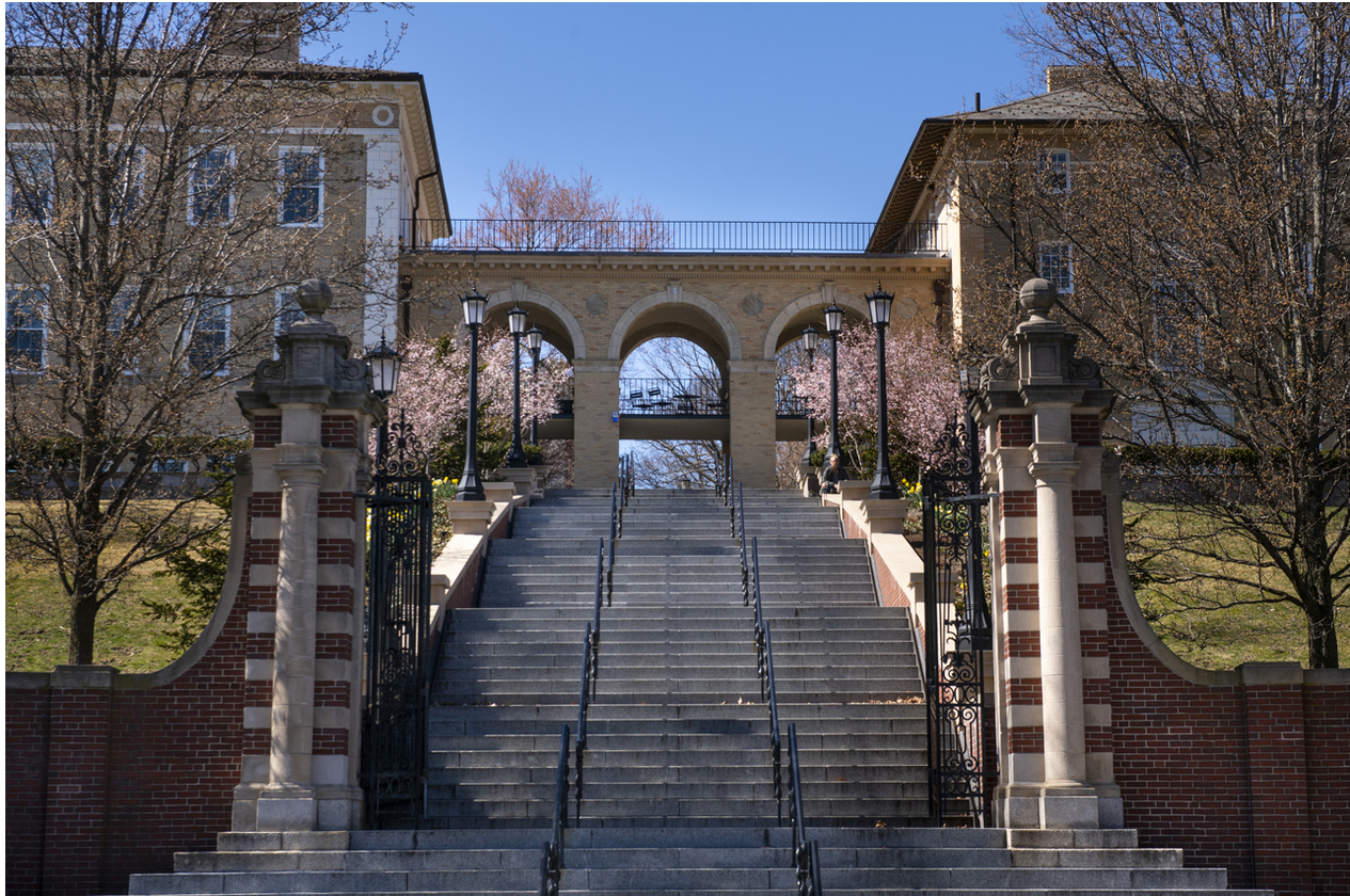
Tufts Memorial Steps, Medford Campus