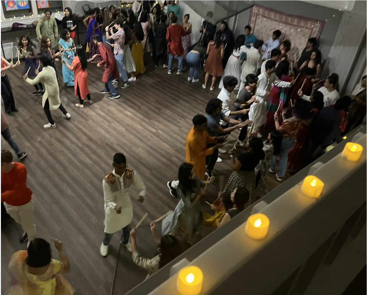
Navratri Celebration at Tufts, October 14, 2022