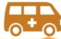
Mobile Teams & Pop-up Clinics

Interactive map available online: toronto.ca/covid19vaccinemap