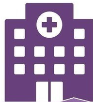
Hospitals / Ontario Health Team Immunization Clinics