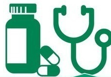
Pharmacies and Primary Care Providers