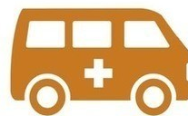
Mobile Teams & Pop-up Clinics

Interactive map available online: toronto.ca/covid19vaccinemap