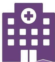
Hospitals / Ontario Health Team Immunization Clinics