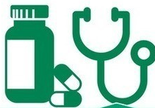
Pharmacies and Primary Care Providers