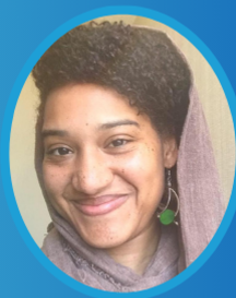
Staff Clinician, Multicultural Specialist, Psychotherapist