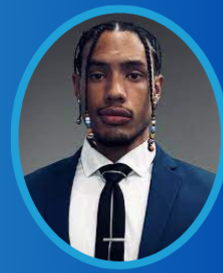
Engineer, Researcher, Economist, PhD Student