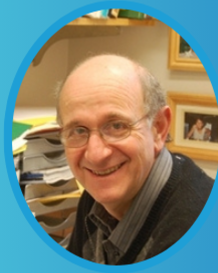
Professor at Tufts Dental Medicine, Medicine, Engineering Director, Tufts Initiative in Civic Science