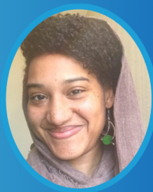
Staff Clinician, Multicultural Specialist, Psychotherapist