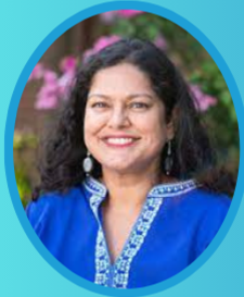
Tufts Hindu Chaplain