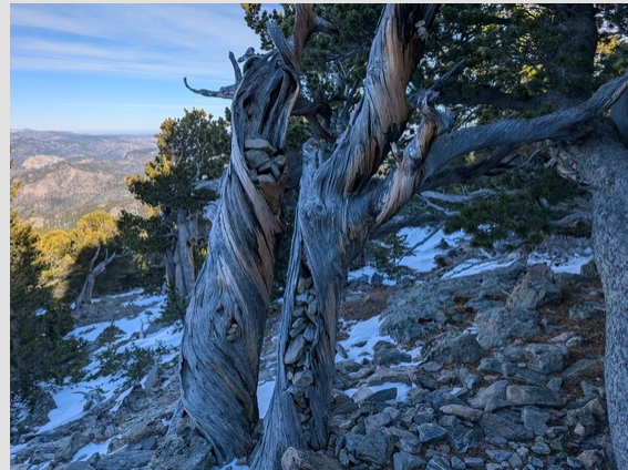
Twin Sisters