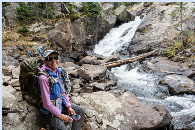
High Lonesome loop hike