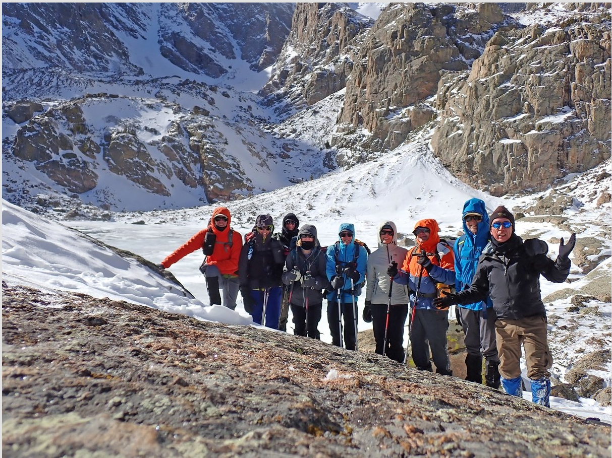
Sky Pond RMNP led and pic by Jim Guerra