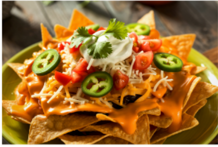
Loaded Chicken Nachos