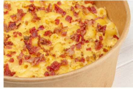
Bacon Mac & Cheese