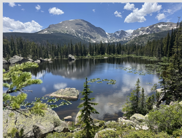
Twin Lk reached off trail from Sandbeach Lk pic and led by Wayne Howell