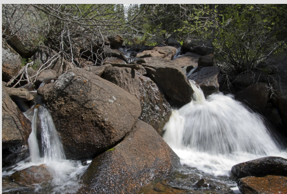
Lost Creek