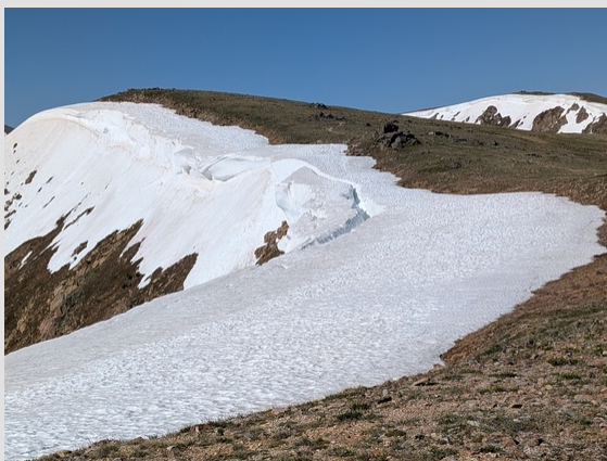
Stanley Mt