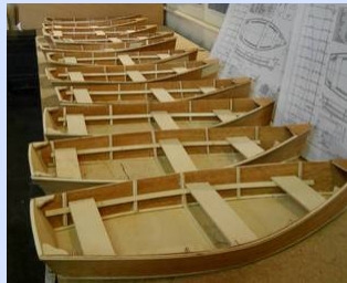
Models under construction