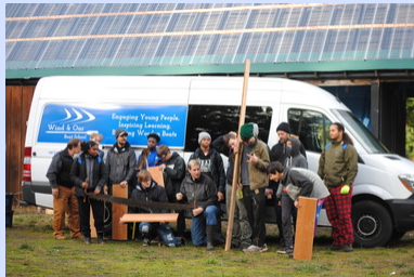
Field trip to Hyla Woods fall '19

In the meantime we are formalizing our project notebooks to better serve our instructors and volunteers.