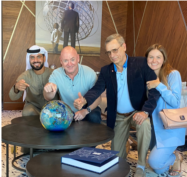
Folks casually noticing a Simpson Megaplanet displayed at the United States Exposition Pavillion in Dubai.

The "Art in Embassies Program" is an office within the U.S. Department of State that promotes cultural diplomacy through exhibitions, permanent collections, and artist exchanges, in more than 200 U.S. Embassies and Consulates. Since the 1980s, Simpson glass has been displayed in dozens of embassies, including Brunei, Cairo, Bujumbura, Singapore, Reykjavik, Kuwait, Manila, and many others.