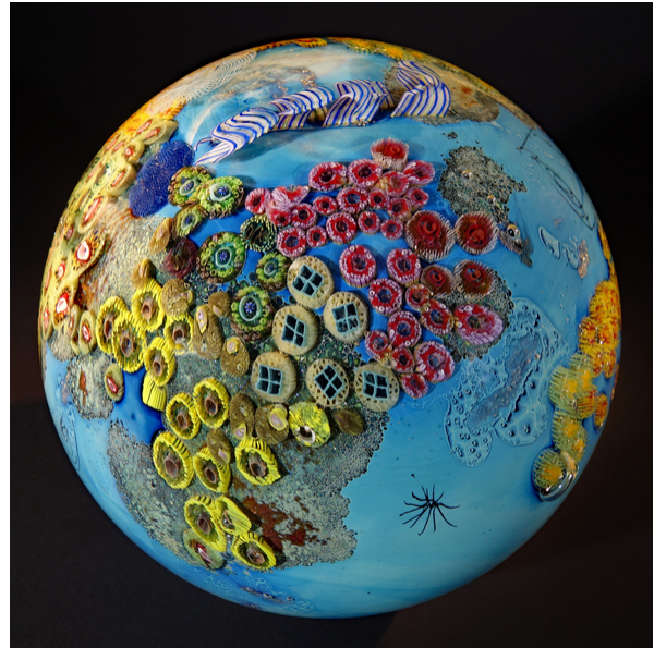
A 9" Megaplanet currently on exhibit, along with two Stellar Disks, at the U.S. embassy in Georgetown, Guyana