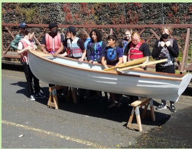
Alliance launches the WnO-12

Alliance HS at Meek launched the Wind & Oar 12 (WnO-12 ). The class ran from December through June. The boat evolved to a new design as students reverse engineered a 1940's Old Town rowboat. It is a beauty. And, Sauvie Island School middle schoolers launched the school's second Bevin's (built throughout month of May)...on the island's on Dairy Creek. Congratulations all!