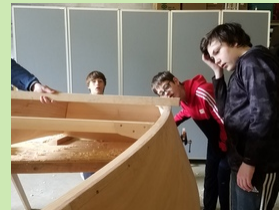
checking your work