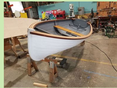
WnO-12 in the shop