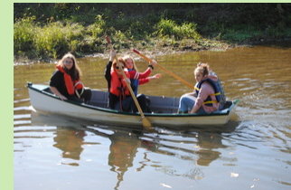
successful launch and row!