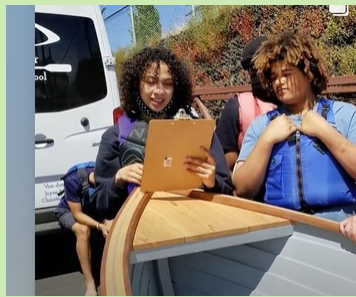
Naming the WnO-12