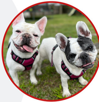
Banks and Yeti