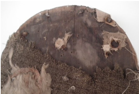
Detail of poplar ironing board covered with layers of fabric, ca. 1840 Liberty Hall Historic Site Collections