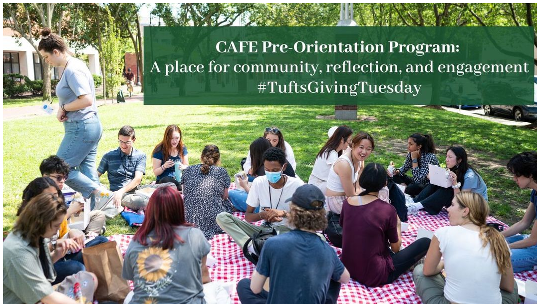
Giving Tuesday 2022: Support the CAFE Pre-Orientation Program