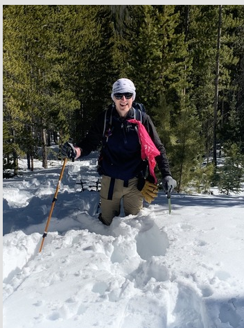
Leland, Fool and King Creek Loop