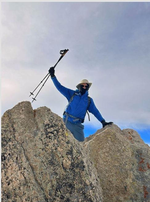
Twin Cones