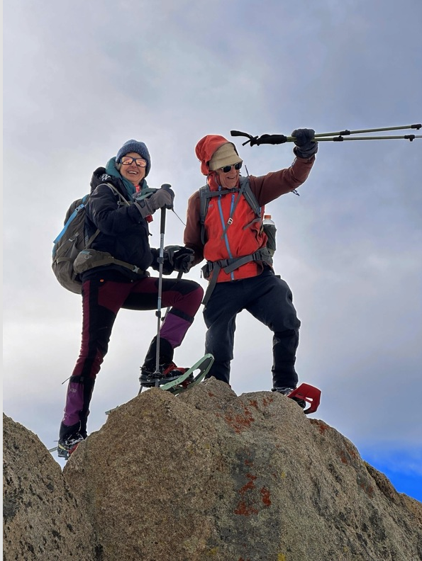
Twin Cones