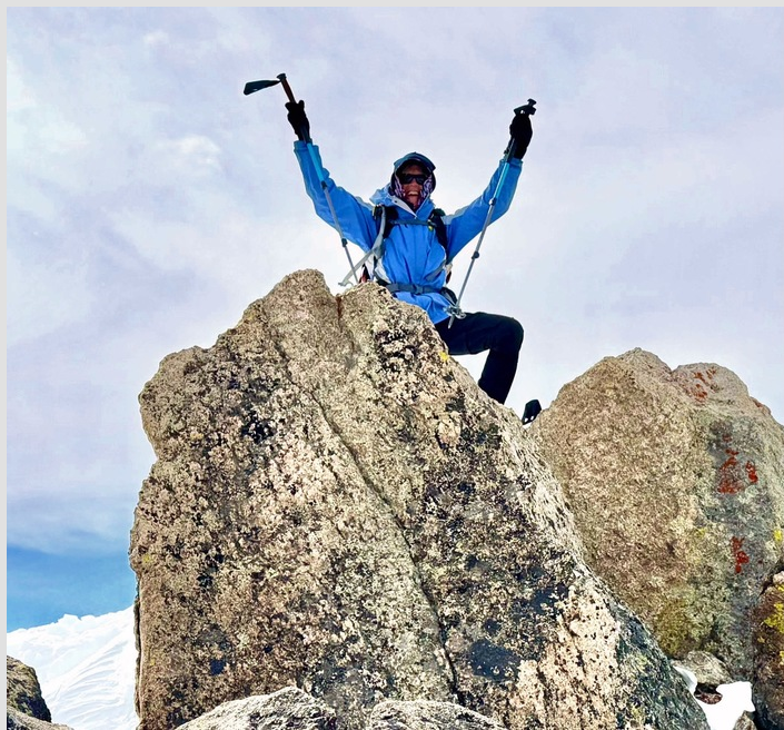
Twin Cones