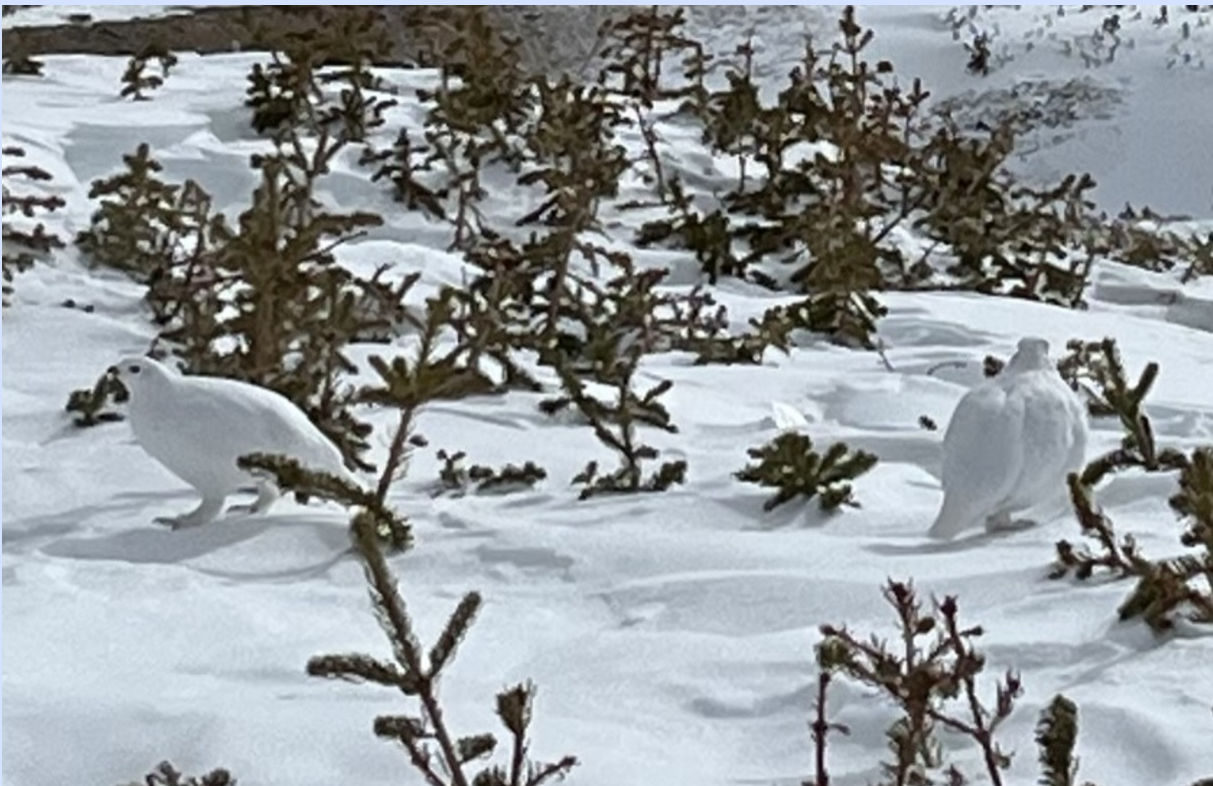
Twin Cones Ptarmigans close up