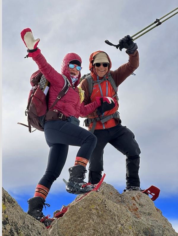
Twin Cones