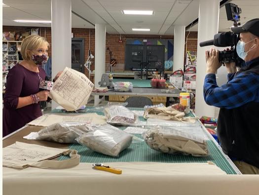
KMBC 9 News Filming @ The Sewing Labs

more about how we are working with VKC, click here .