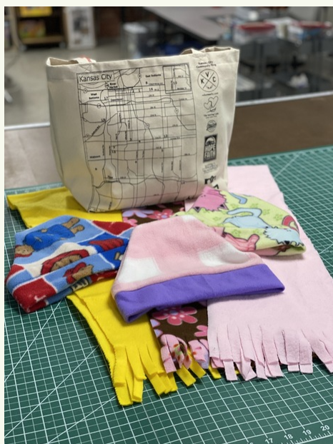
Community Bag, Fleece Hats & Scarves