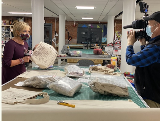
KMBC 9 News Filming @ The Sewing Labs

more about how we are working with VKC, click here .