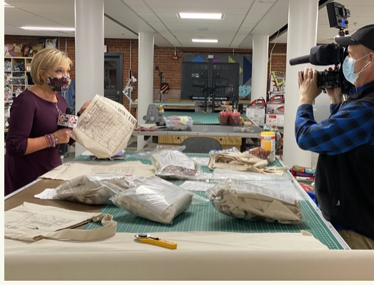
KMBC 9 News Filming @ The Sewing Labs

Our winter-time community outreach projects have caught the attention of many new and existing volunteers! Some of that can be attributed to the KMBC 9 news piece that aired on January 18th announcing our recent partnership with Volunteer KC and the KC Community Bag. To learn more about how we are working with VKC, click here .